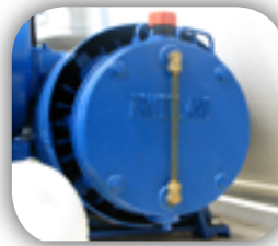
Internal Oil Reservoir

Pump oil should be checked daily depending upon hours of use. Check the owner's manual for specific recommendations.