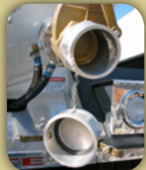
Dust Cap & Fittings

Outlets and inlets have dust cap fittings. The rubber washers can be replaced if they get loose from normal wear.