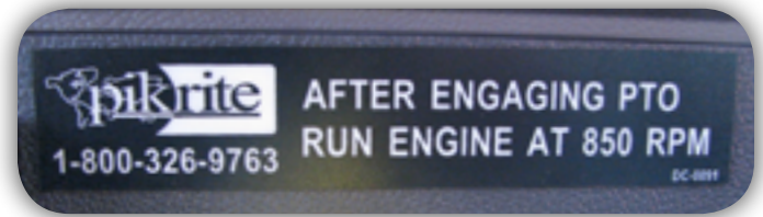
Run Engine at RPM Label