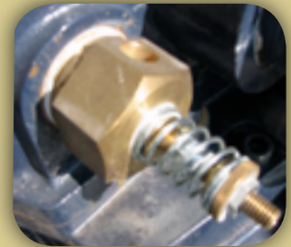
Vacuum Relief Valve