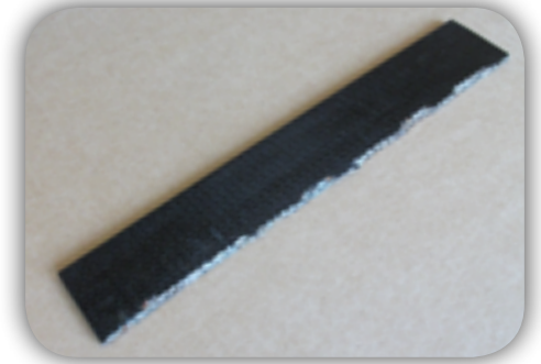
Broken Rotary Vane

Check your owner's manual for manufacturer's recommendations and adjustment instructions.