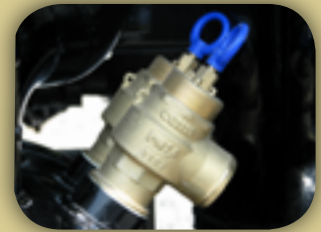
Pressure Relief Valve

If for any reason the pressure relief valve or the vacuum relief valve needs to be reset, follow the instructions listed in the safety and operating instruction manual.