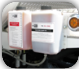
External Oil Reservoir